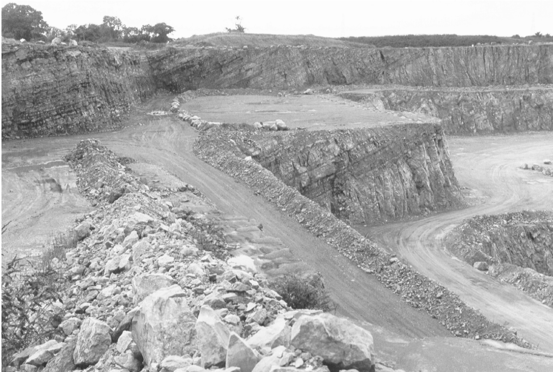
Woodleaze Quarry, Clifton Down Mudstone lying on Gully Oolite