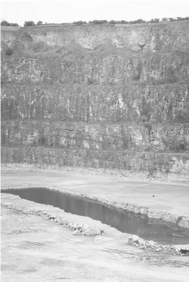
North Quarry, east face, with fault right of centre. The redness of the fault shows staining by Triassic infill