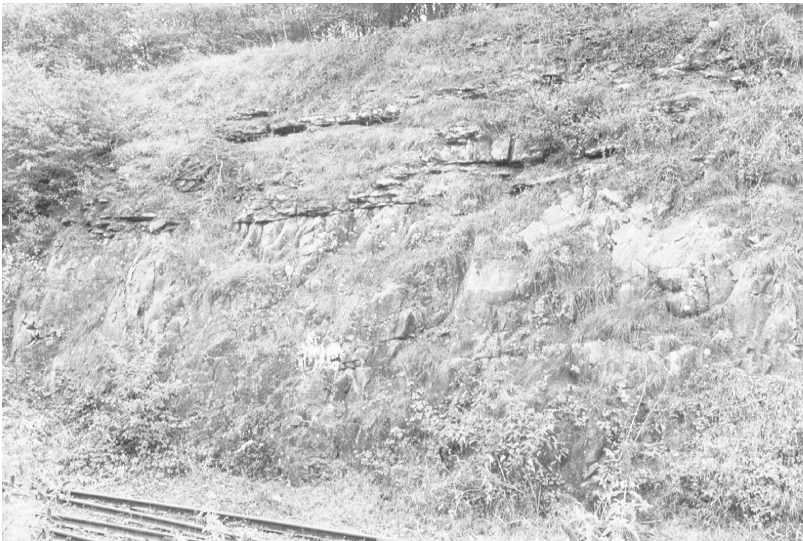
Grovesend Quarry, south-east corner, flat-lying Dolomitic Conglomerate, unconformable on Gully Oolite