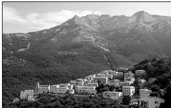
The town of Marciana with Monte Capanne in the background

essential ports, the main towns of the western end of Elba were defensively situated about one third of the way up Monte Capanne. From the higher level town of Marciana, rather than coastal Marciana Marina, there is a cable car to almost the peak of Monte Capanne.