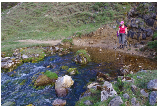
River issuing from the base of the Durness Limestone

Like all limestone formations, and in spite of it being Cambrian (500 mya), the Durness Limestone has all the features – caves, potholes, appearing and disappearing rivers, karstic scenery. One of the walks listed in our guide is called the Bone Caves Walk which leads you up the beautiful valley of the Allt nan Uamh – ‘The Burn of the Caves’ where bones of reindeer, bears and wolves that once roamed these mountains were found in the 19 th century. Later, other species were found, arctic fox, lynx, polar bear and others, along with the bones of man all dated about 4500 old. It is a gentle walk, apart from the last part, up to the caves and takes you along the edge of the small river. After about 200 yards, a small, pretty waterfall marks the spot where a