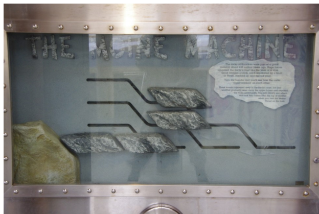
Moine Thrust Machine

Precambrian and then, in stages, forward