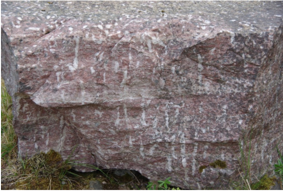
Pipe rock, top part of Cambrian Quartzite

From this exposure the path winds up fairly steeply to the base of the cliff which runs along the mountainside, producing an abrupt stop to the heather - covered slopes climbed so far. Here, an interpretation board and small sculptures tell you the story of the Moine Thrust with a large hand carved from Moine Schist lying on a bedding plane of the lower of two rock beds. This rock is the Durness Limestone, grey when fresh but weathering to the creamy colour seen at this exposure. Immediately in contact with it, the upper 'bed' is very dark Moine Schist. Gill placed her hand on the discontinuity to span, in less than one hand's breadth, a break of 500 million years. On either side of this site, the unconformity stretched along the mountainside and could be followed along the footpath. Presently, the path rose steeply and somewhat precipitously to the moorland at the top from where views allowed one to see all the rock types laid out. Here, with one's back to the Crag, the moor, the 'A Mhoine' of the Gaels, rolled almost endlessly away to the east. To the west, beyond the crag in the distance, Torridonian Sandstone formed the high ground while the middle ground was Durness Limestone, marked by patches of bare rock, and then, in the foreground, a marshy strip with much Cottongrass gave away the outcrop of the Cambrian Basal Quartzite. The path turned abruptly south along the edge of the schist cliff for about half