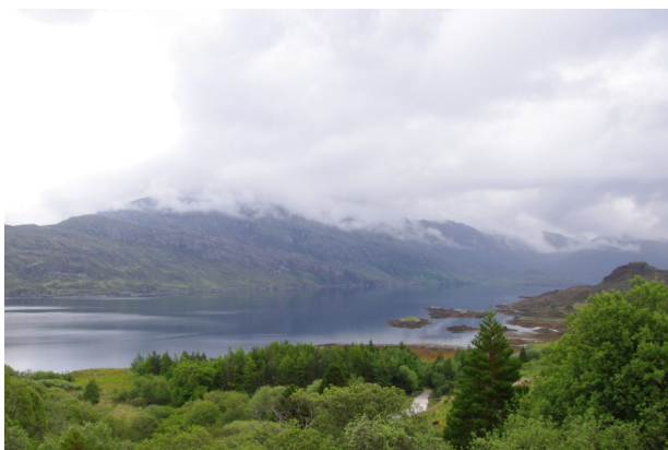
Glencoul Thrust, and, far right, The Moine Thrust

As we drove around Assynt, the thrust evidence was all around. At Knockan Crag, the thrust was the Moine but this turns east at the viewpoint high on the Knockan Crag walk but the road to Elphin follows another thrust, the Sole Thrust, ie. the lowest of the thrust planes where the Durness Limestone has been pushed over the Fucoid Beds. From Elphin north to Inchnadamph, a high cliff rises on the east side of the road and this is the continuation of the Sole Thrust northwards. Just north of Inchnadamph, Ardvreck Castle (16 th century), stronghold of the Macleods, stands on a headland at the east end of Loch Assynt. The loch runs north west from the castle across the Lewisian Gneiss. On the north east side of the loch at its eastern end, a complex of up to 12 thrust planes have been mapped with the main one, the Glencoul Thrust on the eastern edge. It continues northwards and cuts the south east end of Loch Glencoul where the highest waterfall in Britain, at 200 metres, falls into the loch. The guide recommends a boat trip on Loch Glencoul so that the thrusts and waterfall can be seen but, in the event, the boat was not running so we had to be content with viewing