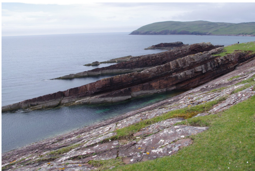
Bedding of Torridonian Sandstone at Clochtol

minister who, in 1780, led many crofters to the New World. However, I was surprised to see a display about the Stac Fada meteorite which struck the Stoer area 1200 mya. In 2008, geologists from Oxford and Aberdeen