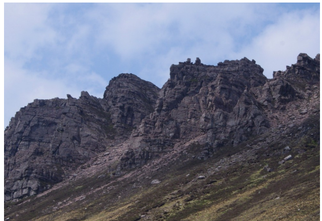
Stac Polaidh showing bedding in Torridonian Sandstone

The following day we drove a few miles west of Elphin along the shore of Loch Lurgainn and parked at the base of the path which leads up to the Torridonian Sandstone mountain of Stac Polaidh (612 metres). The walk is short but very steep with a fair amount of scrambling over rocks with the last section to the summit a mass of pinnacles and gullies sculpted by the ice, being very steep and one long scree scramble. I went to the base of the last section and then turned back – it was a