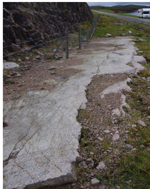
Pipe Rock bed at Knockan Crag

mountainside, the Cambrian Pipe Rock is exposed. This is the uppermost layer of the Cambrian Basal Quartzite and it was spectacularly exposed at the side of the road. In cross section, the rock shows vast numbers of white vertical marks, about 0.5-0.8mm wide, topped off with a widened disc – the trace fossil remains of the vertical burrows of a worm type organism.