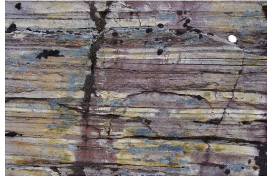
Schist mylonite at Eagle's Rock

From this exposure the path winds up fairly steeply to the base of the cliff which runs along the mountainside, producing an abrupt stop to the heather - covered slopes climbed so far. Here, an interpretation board and small sculptures tell you the story of the Moine Thrust with a large hand carved from Moine Schist lying on a bedding plane of the lower of two rock beds. This rock is the Durness Limestone, grey when fresh but weathering to the creamy colour seen at this exposure. Immediately in contact with it, the upper 'bed' is very dark Moine Schist. Gill placed her hand on the discontinuity to span, in less than one hand's breadth, a break of 500 million years. On either side of this site, the unconformity stretched along the mountainside and could be followed along the footpath. Presently, the path rose steeply and somewhat precipitously to the moorland at the top from where views allowed one to see all the rock types laid out. Here, with one's back to the Crag, the moor, the 'A Mhoine' of the Gaels, rolled almost endlessly away to the east. To the west, beyond the crag in the distance, Torridonian Sandstone formed the high ground while the middle ground was Durness Limestone, marked by patches of bare rock, and then, in the foreground, a marshy strip with much Cottongrass gave away the outcrop of the Cambrian Basal Quartzite. The path turned abruptly south along the edge of the schist cliff for about half