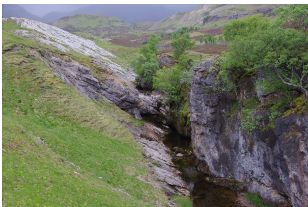
Traligill Thrust Plane and Karstic Surface

The next day we drove north again, this time to Inchnadamph and took another walk in the guide, the Traligill Caves Walk, which goes up the valley called 'Valley of the Trolls' by the Norse invaders of Assynt. After about half an hour of walking, the path splits with the left one climbing up to Conival and Ben More Assynt, both 'Monros' ie over 3000 feet high, where the Moine Thrust is spectacular with the Lewisian Gneiss being thrust west over the Cambrian Quartzite. Not for us, though. We turned right and headed down the field to the river where the Durness Limestone could be seen. Here, the limestone is in two distinct