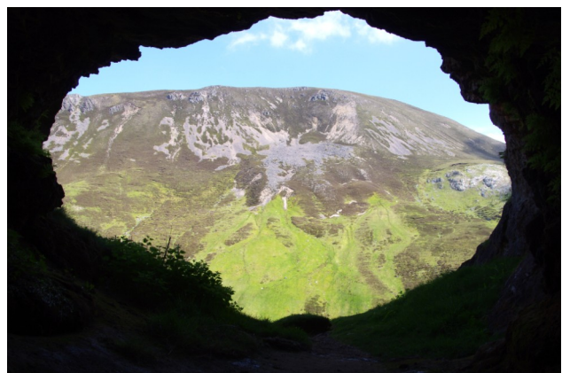
View from the small cave to limestone scree and quartzite capping

This cool, crystal clear water has disappeared into the limestone much higher up the valley and only runs in the now dry river bed when in flood. In June 2010, the Highlands had had one of the driest springs for years. A benefit of this dryness was that all the different rock types in Assynt could be found in the river bed as a result of erosion and transport by the ice sheets with the Pipe Rock being one of the most obvious. At the top of the valley, one could strike off up into the rocks of the Ben More Thrust but we headed to the right to climb the narrow, vertiginous path to the Bone