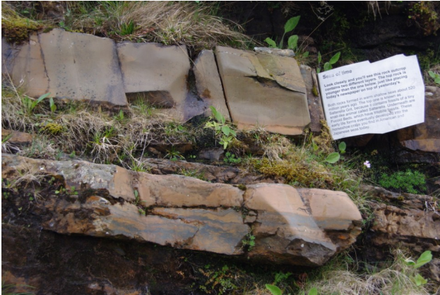
Cambrian Furoid Beds overlain by Salterella Grit

the Knockan Crag walk in the Assynt guide, the whole process and its constituent parts could be seen, touched, photographed – and wondered at! (Sadly, very few visitors actually follow the path and see the features so well described and highlighted.) The path leads