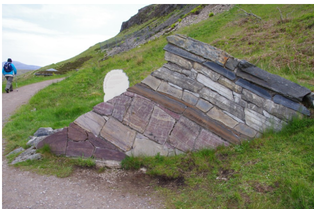
Knockan Crag Puzzle

internal structure, then carved with the name of each rock type and then all set in a cairn-