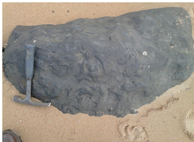
Fig 8, Trace Fossils in Bituminous Beds

preserved trace fossils (Fig 8). In an interesting recognition of Brora's geological heritage, there is a large ammonite on the face of one of the dressed stone blocks in the town's war memorial. (Fig 9)