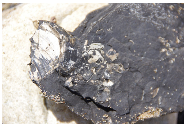
Fig 6, Fossils in Jurassic Beds 6,

are well exposed at low tide but have been heavily eroded by the sea and are considerably obscured by the blocks of conglomerate of the Helmsdale Boulder Beds, sand and seaweed. North of the river mouth, the yellow sandstone of the Fascally Siltstone, highly bioturbated and rich in ammonites and bivalves, succeeds the Brora Brick Clay member (Fig 6) but south of the river, there was only the yellow sandstone exposed which was generally unfossiliferous. However, some fossils can be found on the surfaces of the rocks although they are well worn and, to the south of the river, crumbling pebbles of grey mudstone displaying the white fossilised remains of bivalves can be found on the beach. Due to the friable nature of the rock, they are useless as specimens but their appearance is identical to the friable whitish fossils that can be found at Kimmeridge Bay in Dorset. Fig 6.