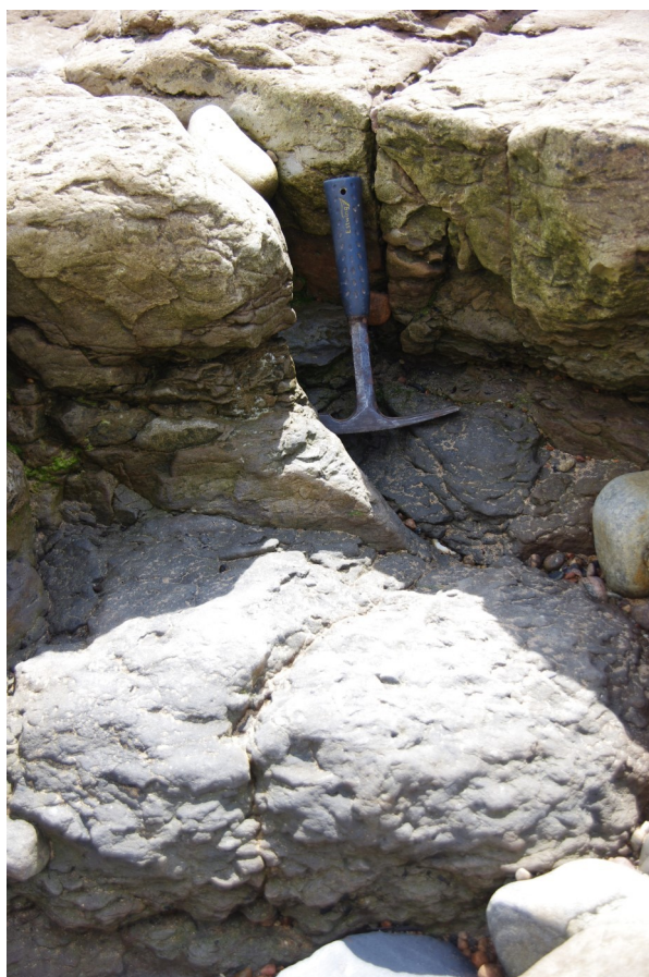
Fig 5, Siltstones overlying the bituminous sandstone

are well exposed at low tide but have been heavily eroded by the sea and are considerably obscured by the blocks of conglomerate of the Helmsdale Boulder Beds, sand and seaweed. North of the river mouth, the yellow sandstone of the Fascally Siltstone, highly bioturbated and rich in ammonites and bivalves, succeeds the Brora Brick Clay member (Fig 6) but south of the river, there was only the yellow sandstone exposed which was generally unfossiliferous. However, some fossils can be found on the surfaces of the rocks although they are well worn and, to the south of the river, crumbling pebbles of grey mudstone displaying the white fossilised remains of bivalves can be found on the beach. Due to the friable nature of the rock, they are useless as specimens but their appearance is identical to the friable whitish fossils that can be found at Kimmeridge Bay in Dorset. Fig 6.