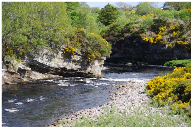
Fig 1, Jurassic Beds in River Brora

The town of Brora is situated on the east coast of Sutherland in Scotland 59 miles north of Inverness, on the A9. It is a small attractive seaside town with a harbour through which the River Brora enters the sea. Just inland of the harbour the river runs through a gorge for about half a mile, having cut a course through the yellow sandstone. Fig 1