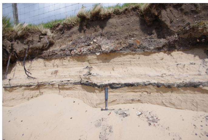
Fig 3, Coal layer under old coal mine site

The first evidence of coal at Brora, like many other localities on the North Sea, was the ever present supply of ‘sea coal’ – pieces of coal which had been eroded from the sea floor and washed onto the beach and into the river. This supply had been used by the folk of Brora for centuries, the first record being in 1529, and was also extracted from shallow mines on the coast since the late 16 th century to supply the heat for the salt pans which were established behind the beach just south of the harbour. Unfortunately, coastal erosion has removed most of the ruins of the salt pan buildings while those remaining have been demolished but a remnant of the past industry can be seen nearby in the line of small two storey houses in Salt Street. However, a low ‘cliff’ in the sand at the back of the beach showed a thin