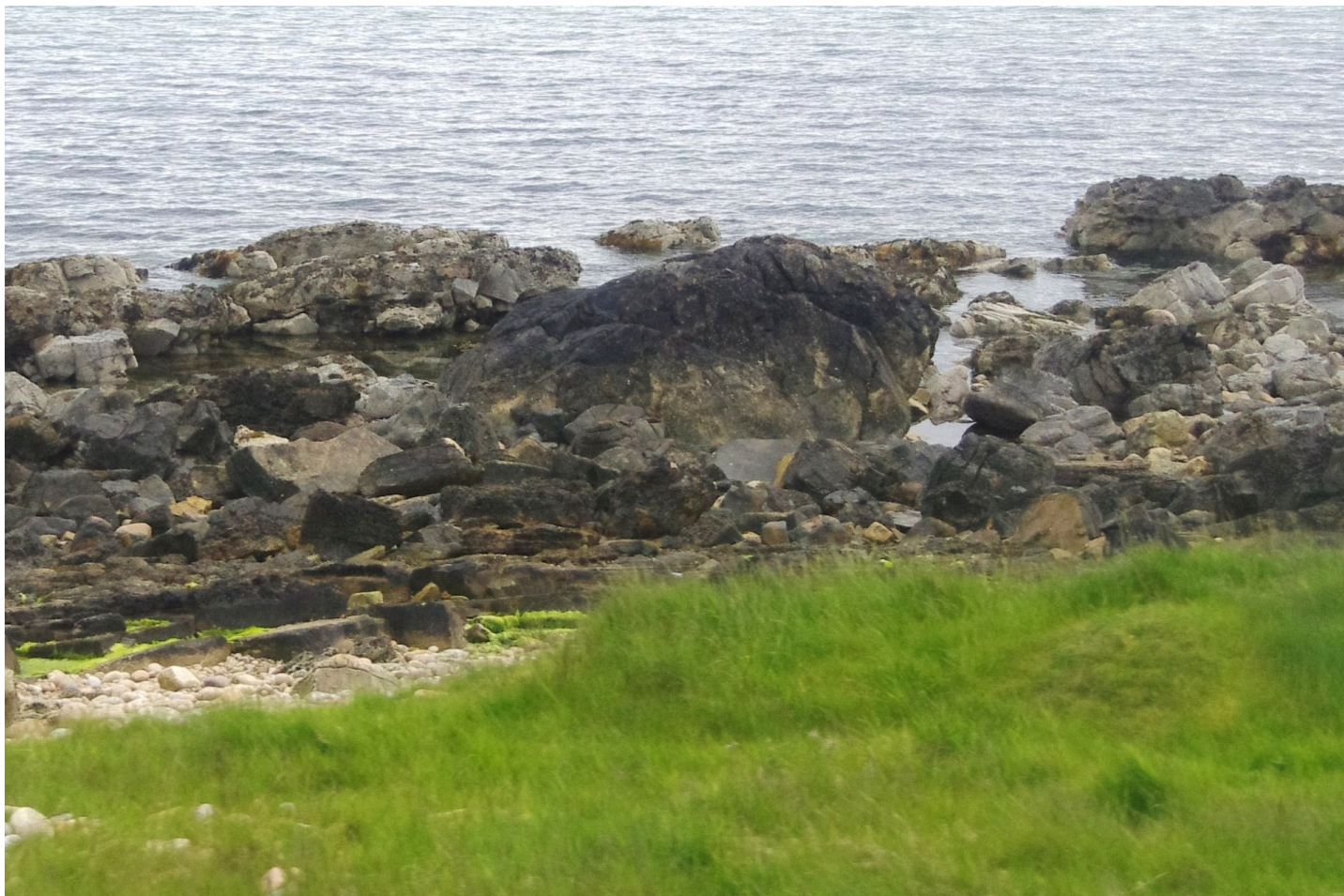
Fig 10, Conglomerate of the Helmsdale Boulder Beds

decades but is now taken to be the result of debris flows, turbidity currents and storm surges, caused by repeated movements on the Helmsdale Fault which triggered huge sediment movements over the edge of the fault scarp and from submarine fan deltas into the chasm on the edge of the developing North Sea Basin. During quieter times, soft sediments were deposited over and around the boulder beds and these soft sediments also caused sliding to redeposit the boulder components.