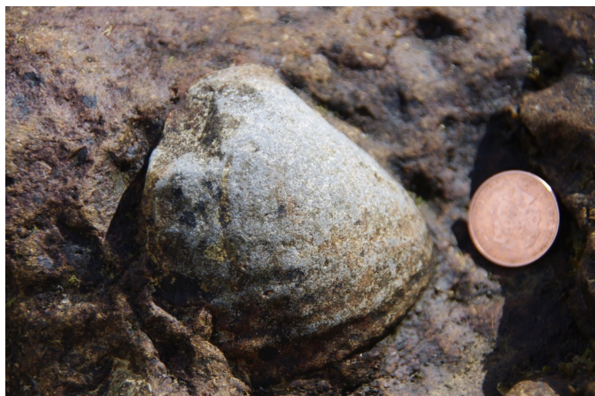
Fig 7, Trigonia in siltstone

preserved trace fossils (Fig 8). In an interesting recognition of Brora's geological heritage, there is a large ammonite on the face of one of the dressed stone blocks in the town's war memorial. (Fig 9)