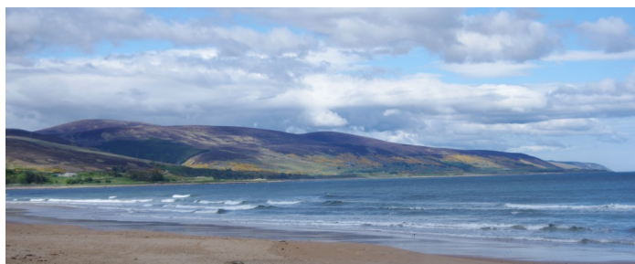
Fig 2, Coast from Brora north

On the coast of the North Sea, The Links – extensive grassy low sand dunes – run north from the river for some miles and provide the town with its local golf course, also shared with sheep, cattle and walkers! Just to the south of the harbour another small area of dunes was the site of another golf course, named ‘the other Gleneagles’ which was used by the townsfolk who were barred from the main course. These Links and the town lie on a broad raised beach of